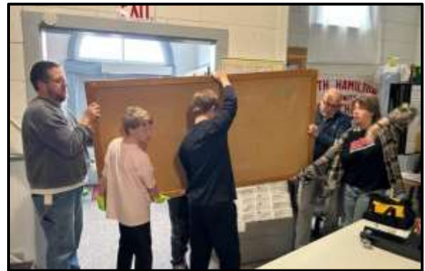
Volunteers help move bulletin board

In April, the museum underwent some reorganization, as some exhibits were added and others were rearranged, with considerable help from South Hamilton students and staff.