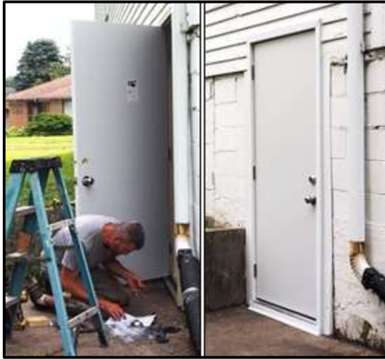
Replacement of the Museum's Northeast Door

help of a local contractor, this now serves as a safe and effective egress!