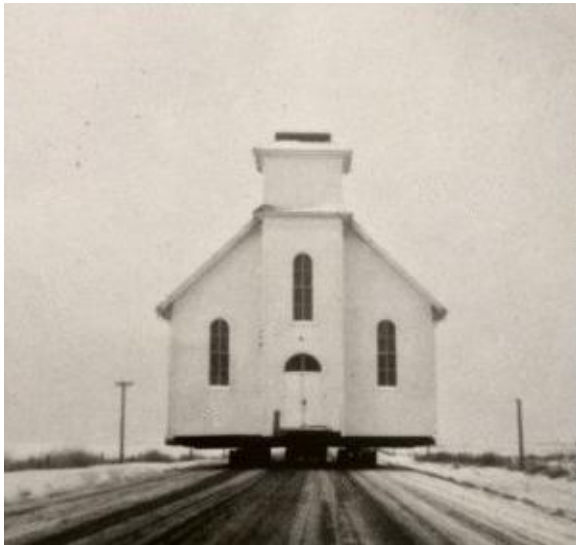
In January of 1956, the building was moved from that location to its current location at 501 Johnson St. in Jewell