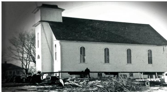
The building was placed atop a foundation on that site which had served a previous church there, and several congregations

occupied the building over the ensuing years. The last was the Victory Christian Fellowship, which moved into a newly built facility, then sold the old building for $1.00 so that a Museum could be started in Jewell.