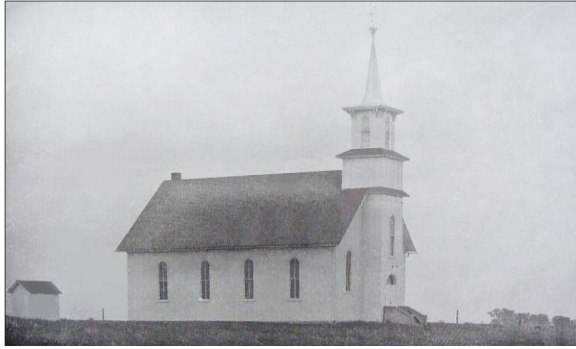
The Jewell History Museum began its life as the first and only church building of the North St. Petri Lutheran Church, two miles east and one mile north of Randall IA.