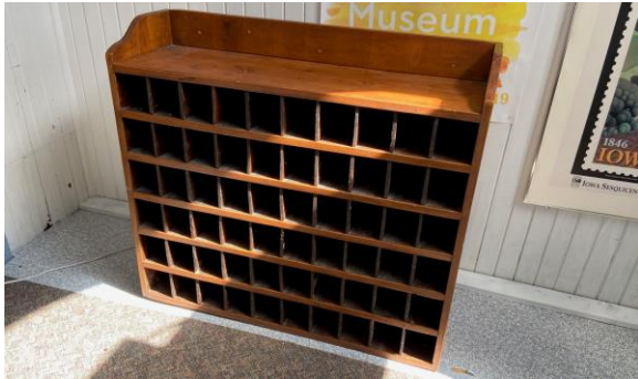
Cubby-Hole-Type Storage Cabinet